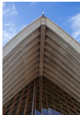
Opera House Concrete Ribbing